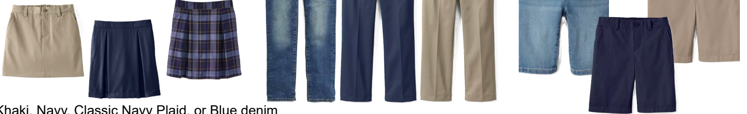
Khaki, Navy, Classic Navy Plaid, or Blue denim