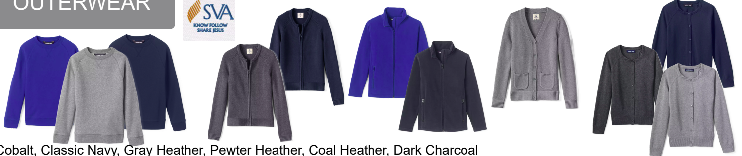
Cobalt, Classic Navy, Gray Heather, Pewter Heather, Coal Heather, Dark Charcoal

All top layers must display the SVA embroidered logo