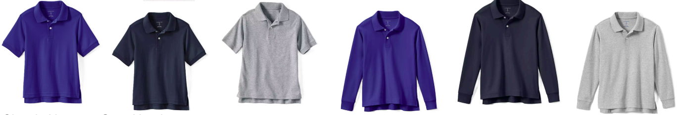
Cobalt, Classic Navy, or Gray Heather

All top layers must display the SVA embroidered logo